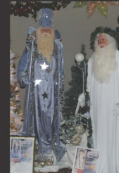
SANTAS AROUND THE WORLD ART DISPLAY