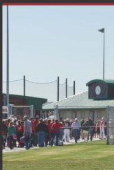
GREAT BEND SPORTS COMPLEX