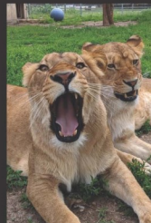
THE FREE GREAT BEND BRIT SPAUGH ZOO