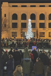
TRAIL OF LIGHTS & HOLIDAY FESTIVAL